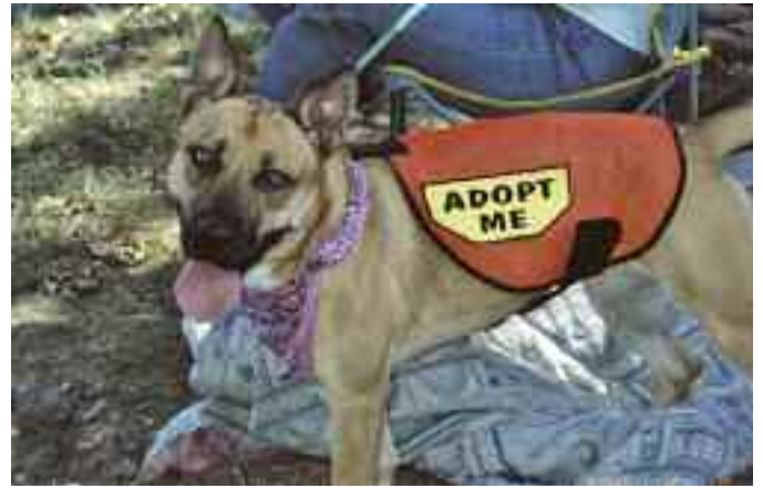
Meet Duggan, a Jindo, who has been at the Society for a year! He gazed at each passerby hoping for a home. The "Adopt Me" sign didn't work....he is still at the Forked River shelter.