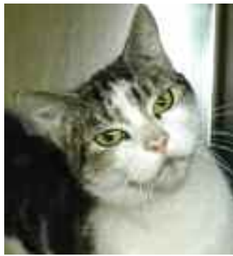
Backup and Carolina are in the free-roaming Kitty City #2 located in Tinton Falls & waiting for a lifetime of love.

Thirty-five Beagles and six cats, which previously spent their lives as subjects in cruel animal tests & inhumane treatment at a North Carolina laboratory, have now been given a "new leash on life" at Associated Humane Societies/Popcorn Park after being rescued from the closed down facility.