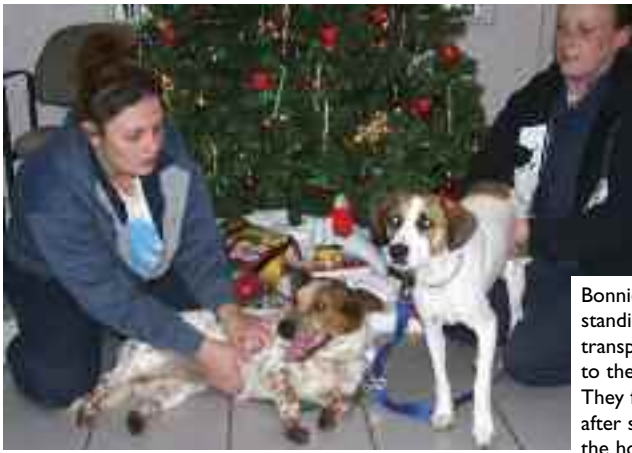
Bonnie & Clyde had a long-standing romance until a transport separated them due to the imminent birth of pups. They finally were reunited after several weeks & enjoyed the holidays at Popcorn Park.