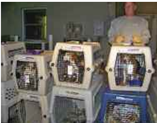
Thirty hours after departure, staff returns to Forked River. The Beagles and cats await to be taken inside and settled into their much improved living conditions. Pictured is Larry Donato.

The AWI gave cooperating shelters 24 hours notice to rescue the 200 dogs & 50 cats or they would be killed. The lab had already killed almost 100 cats, rabbits & dogs because the daily cups of food were too expensive.