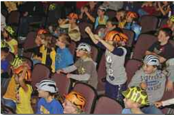
The 3rd and 4th graders, many in zoo themed hats, clearly enjoyed the assembly!