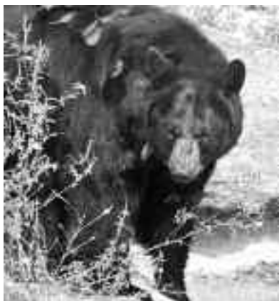
Pictured is Boo Boo, one of Popcorn Park's rescued black bears.

will be mother bears with cubs who are still nursing. No reason supported by science has been presented to justify the hunt. Please call, write, fax Gov. Chris Christie at Phone: 609-292-6000, Fax: 609-292-3454, on the web site at http://www.state.nj.us/governor/contact/ (pick Environment, and then Fish & Wildlife)