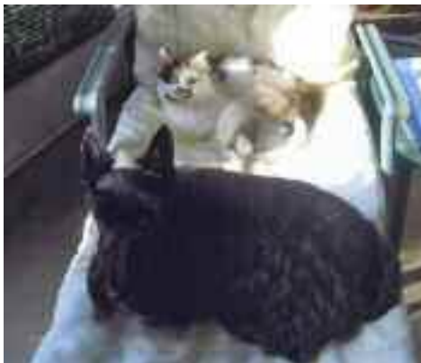
My friend, Chevy the Scottie