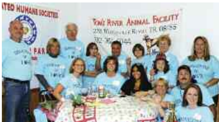
The group known as "Donations for Love" raise funds for local animal groups. They helped make Snooki's (center) appearance a huge financial success!

signing autographs for her fans – and there were hundreds who came -- many from as far away as Colorado! The charge was $10 to enter the local Community Center and $10 for Snooki's autographed picture. As a result of her efforts, she raised $6,023.50 to be donated to Seaside Heights Spay/Neuter Program, the Toms River Animal Facility and to Popcorn Park. At the end of the day, Snooki gave a very generous amount to Popcorn Park as her favorite pet charity! Our thanks to Snooki – a pint-sized lady with a huge heart.