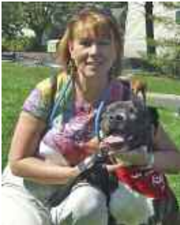
Brock looking his most handsome in hopes of finding love.

Featured below are some of the wonderful volunteer animal handlers who helped the dogs in their quest for a lifelong home. Thankfully, ALL (yes, all) found forever homes. And Irving the Lhasa Apso, above, was also adopted. No dogs were adopted at the site, but were adopted through the Society's Newark shelter.