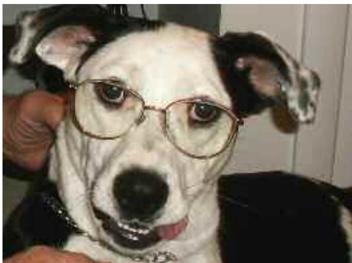
Cupcake needs glasses to keep watch on Princess's NFL picks. She's been pretty good, lately.