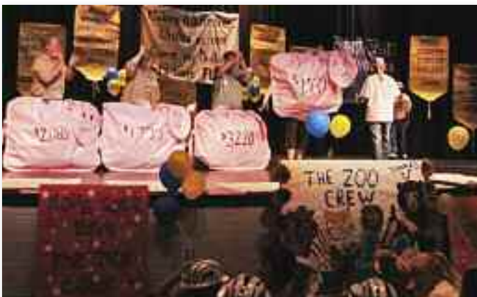
The afternoon assembly culminated in the presentation of a check to Ranger Dave. Each pink pig showed the amount of donations collected at a certain point in the fundraiser.

A humorous slide show was also shown of two teachers touring the zoo. For the next ten days, students collected money, purchased animal hats, wrist bands, dog tags and brought in money for the change jar. The culminating activities were a walkathon in the morning and another assembly in the afternoon to present Ranger Dave with a check. The assembly once again featured elaborate decorations, dance music and skits by teachers in animal costumes as well as a slide show of student activities from the ten day fundraiser.