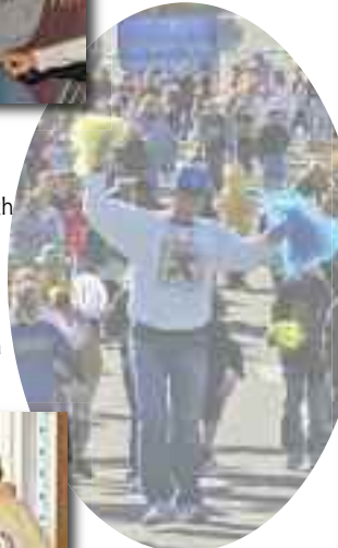
A huge walkathon for the animals was held in the morning with all the students participating

McKINLEY AVE. SCHOOL IN MANAHAWKIN RAISES $10,279 FOR POPCORN PARK!!