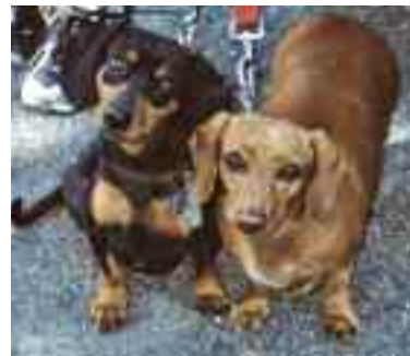
A fantastic home has been found for these two Dachshund littermates!