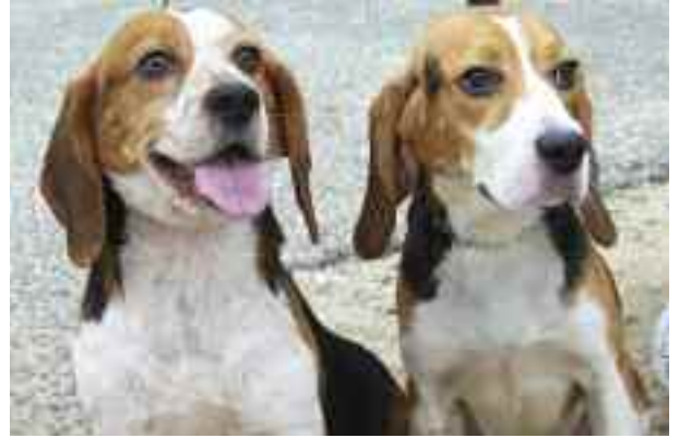
At left is Riley, File 19949NM, and Gemma at right, File 19958SF

In order to prepare for this rescue, AHS staff watched PETA's undercover video -- an emotionally draining effort to see the unbelievable horrors that went on not only in the testing, but the employees throwing & dragging petrified dogs, violently slamming cats against cyclone fencing & into cages and more. These animals lived without the touch of a kind hand or a kind word. The dogs had to contend with pressure spray hosing - covering them with water, bleach -- exposing those with open sores to harsh chemicals.